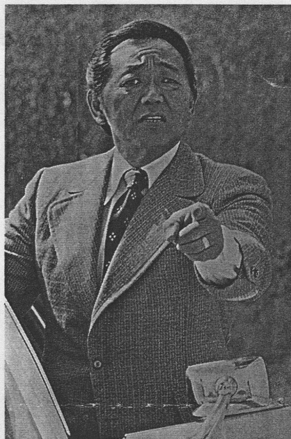
Kam Fong was an audience favorite as Detective Chin Ho.